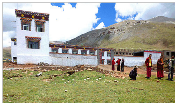
Pic 2: Karma Woesel Doe-joe Ling Hospital

In 2005 Rinpoche initiated the construction of a Tibetan hospital. The project aims to provide basic health care as well as emergency care, surgical services and education to the people of the region. It is also, wherever possible, free of charge for the people of the Nangchen County. The hospital comprises 5 small rooms, 30 large rooms and a main prayer hall. It is Rinpoche's heart's desire that one day modern academic medicine will also be available, including x-ray and ultrasound machines, laboratories and an intensive care unit. He hopes that in future Western medical doctors will work at the hospital for a period of time.