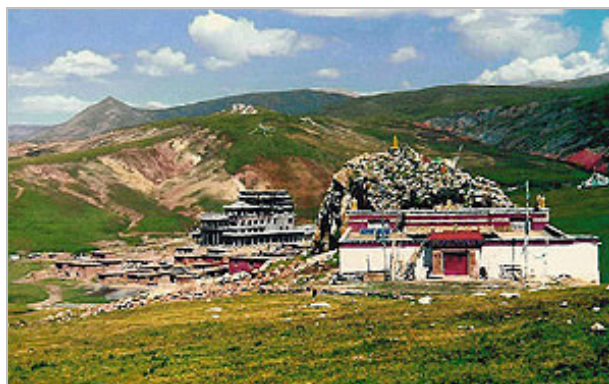
Pic 1: Pal Demo Tashi Choe-Ling Monastery