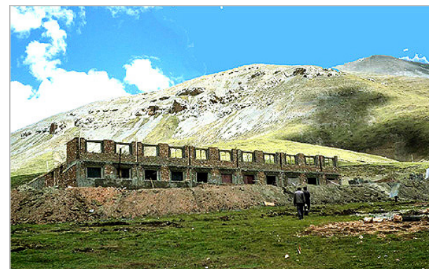
Pic 4: KWDL Medical School, construction in progress

Pal Demo people are famous for producing Tibetan herbal medicine. The methods of making these precious healing pills have been passed down for hundreds of years, and are highly sophisticated. Extensive prayer rituals must accompany the collecting, drying and preparing of herbs.